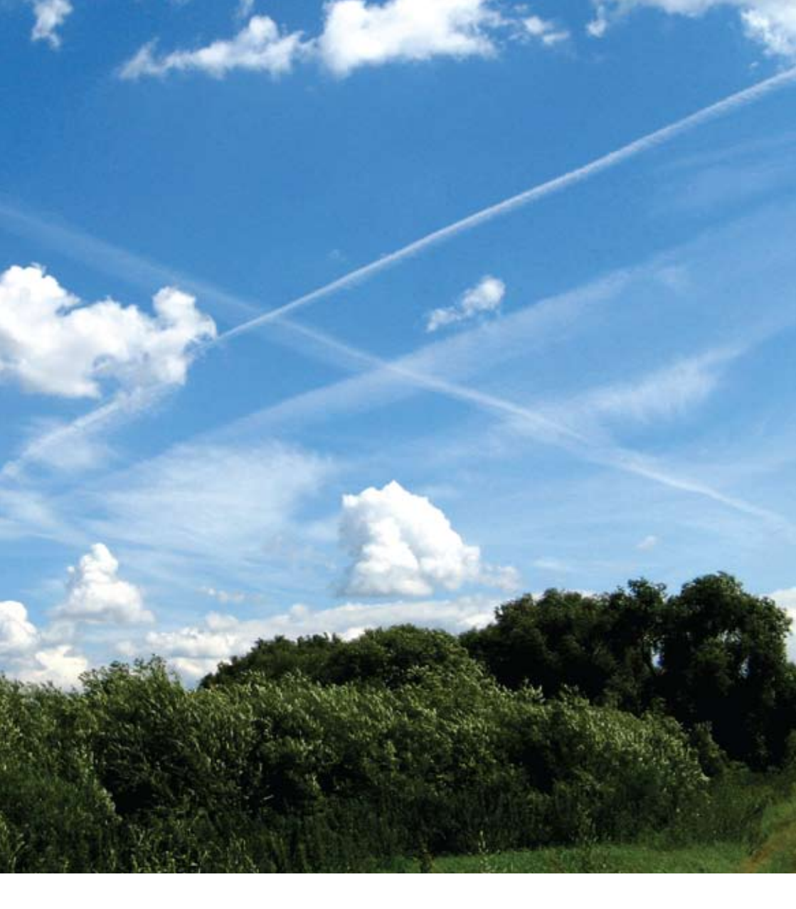
ADVANCE DECISIONS TO REFUSE TREATMENT A Guide